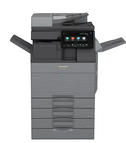
BP-50C65 shown with Inner Folding Unit, Right Side Exit Tray, and 2-drawer Paper Deck.