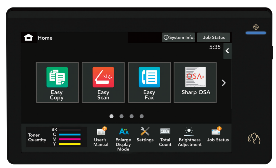
10.1" (diagonally measured) customizable touchscreen display.