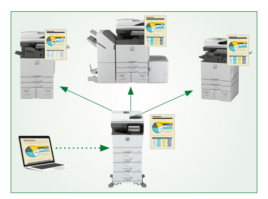
With Serverless Print Release you can securely print a job and release it from up to six Sharp MFPs (including host).