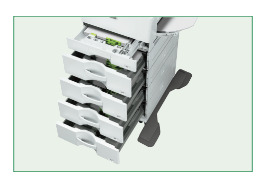
Both models offer up to six paper sources for a maximum 2,700-sheet capacity (shown with optional trays).