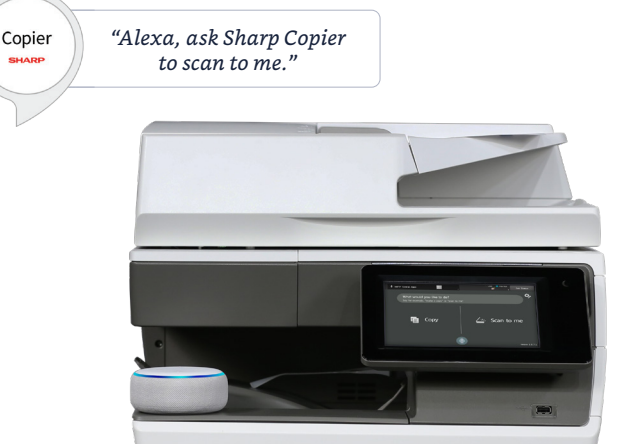
MX-C304WH shown with available Sharp MFP Voice feature with Alexa.

Sharp has always been known for enhancing MFP productivity in the workplace by offering innovative, easy-to-use features. Sharp has done it again with the MFP Voice feature available for color document systems. With the Sharp MFP Voice feature, you can interact with the machine just by using the power of natural language. With simple voice commands, you can ask the Sharp MFP to make copies or scan a document.