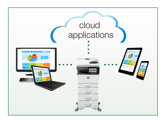
Distribute, access and print documents more easily.