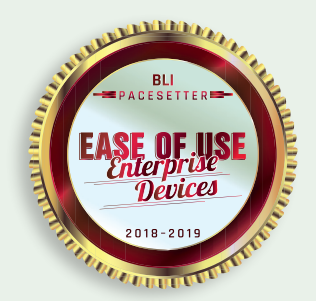
"PaceSetter Award in Ease of Use 2018–2019"