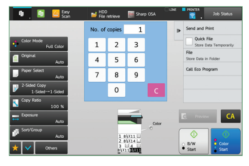
Standard Copy Screen offers more advanced features.