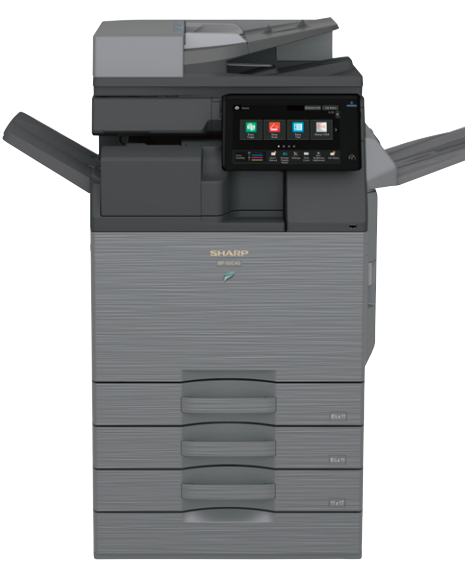
BP-50C45 shown with Inner Folding Unit, Right Side Exit Tray, and 2-drawer Paper Deck.

10.1" (diagonally measured) customizable touchscreen display.