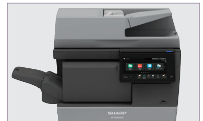
Optional compact inner finisher offers stapling, offset stacking and sorting.

Compact designs with advanced workflow features for virtually any size office.