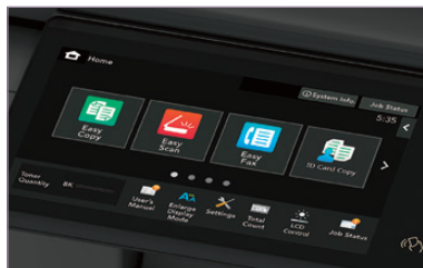
Easy touch display with customizable menus.